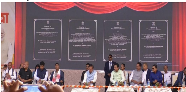
Foundation Stone Laying Ceremony by Dr. Himanta Biswa Sharma, Hon'ble CM, Assam

A major milestone in the university's journey was reached on 6th March 2024, when the Hon'ble Chief Minister of Assam, Dr. Himanta Biswa Sarma, laid the foundation stone of Sri Sri Aniruddhadeva Sports University. This event marked the formal initiation of the university's physical infrastructure development and was a moment of great pride for the institution and the region.