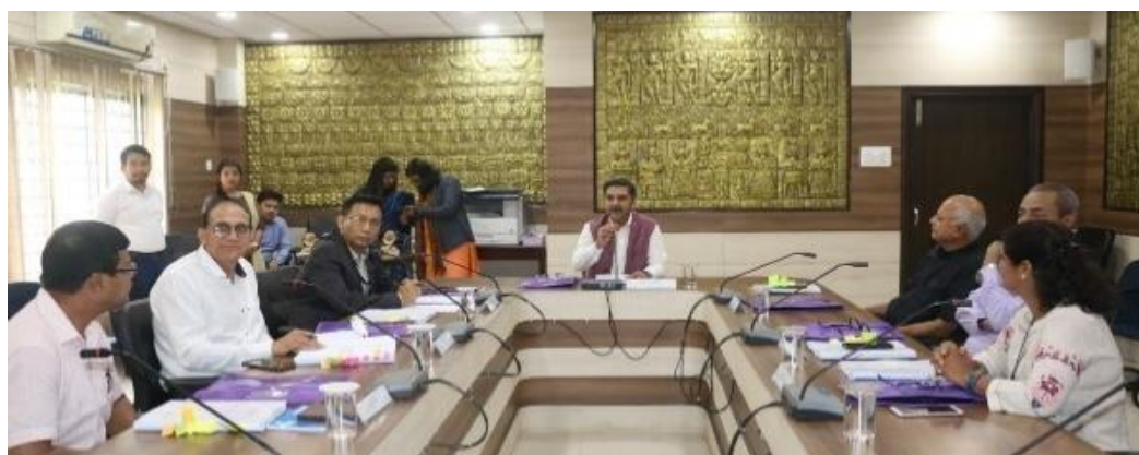
Hon'ble Members of the first Academic and Activity Council of Sri Sri Aniruddhadeva Sports University

To date, the university has successfully conducted eight Executive Council meetings, two Court meetings, eleven Academic & Activity Council meetings, and six Finance Committee meetings, reflecting a robust governance framework.