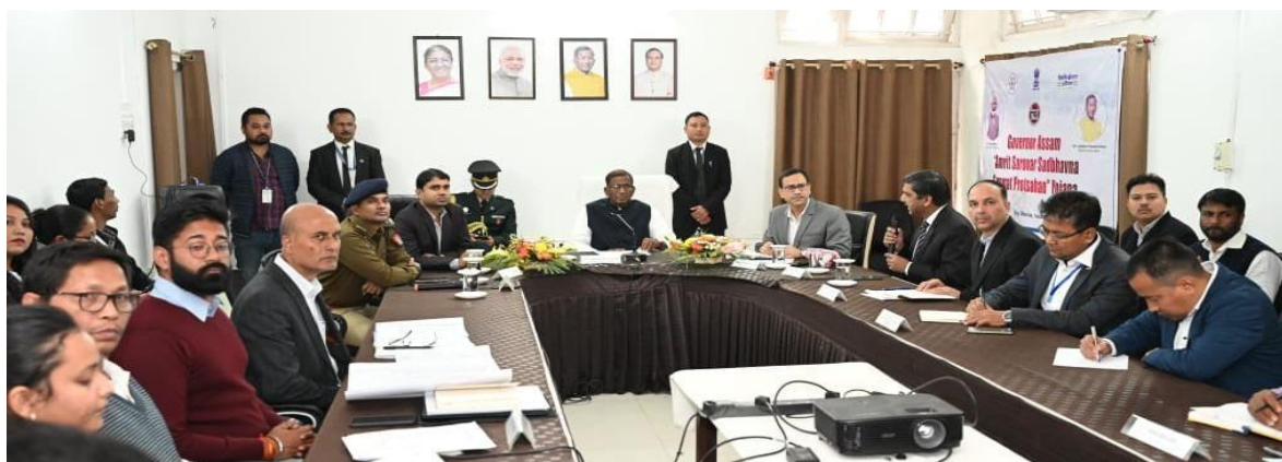
Hon'ble Chancellor cum Governor of Assam, Shri Lakshman Prasad Acharya, during his address in the high-level review meeting.

Despite the formalities being completed, actual construction work did not commence for over a year