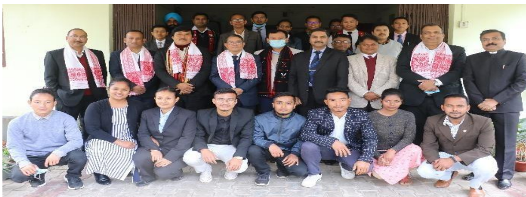
First batch of Post Graduate Diploma in Sports Coaching

The inaugural cohort comprised nine students. Later, one candidate's admission was cancelled as he could not submit his NOC from his employer for being a regular student, which was one of the prerequisite conditions of the program. The remaining eight students (four from Assam and four from other states) continued in the program. Upon completion of the programme, all graduates secured employment: the four students from Assam were appointed as Physical Instructors or