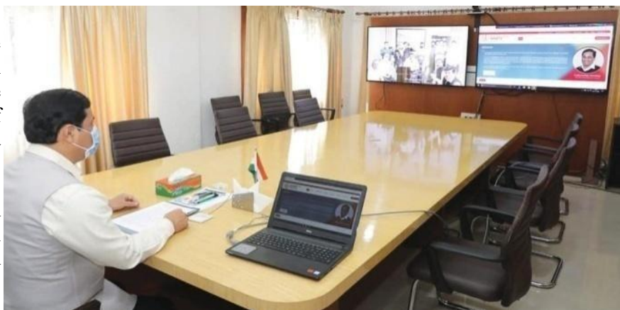
Inauguration of the website by Shri Sarbananda Sonowal, the then Hon'ble Chief Minister of Assam

The official website of the university was launched on 6th October 2020 by the then Hon'ble Chief Minister, Shri Sarbananda Sonowal, via virtual mode. He commended the university for its rapid digital transformation despite COVID-related constraints.