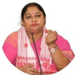
Smt. Karnam Malleswari Padma Shri, Arjuna Awardee India's first woman Olympic Medalist Member, Executive Council