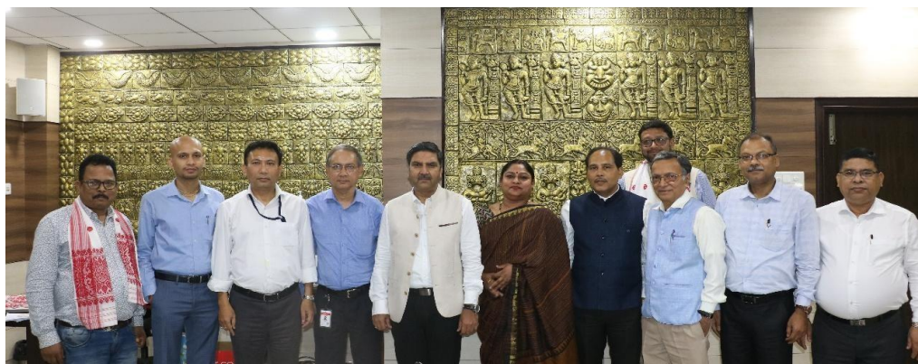
Hon'ble Members of the first Executive Council of Sri Sri Aniruddhadeva Sports University