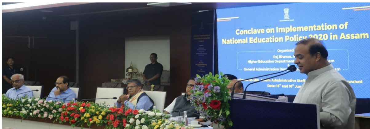
Hon'ble Chief Minister of Assam, Dr. Himanta Biswa Sharma, addressing the NEP 2020 Conclave.

The grant facilitated significant progress in establishing essential infrastructure and academic resources. It enabled the university to procure a dedicated bus, gym equipment, IT infrastructure, digital boards, podiums, laboratory apparatus, library materials, and necessary furniture. It also supported the recruitment of faculty members specifically for the NEP undergraduate programme, thereby strengthening the academic foundation of the institution.