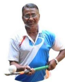
Shri Ashok Kumar (Hockey) Arjuna Awardee Key player in India's 1975 Hockey World Cup win Member, Academic & Activity Council