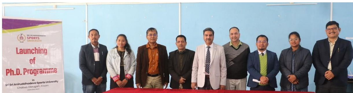
First batch of PhD students along with the Vice Chancellor and other officials

The admitted scholars shall undertake research across a range of impactful areas, including sports psychology, exercise physiology, sports biomechanics, physical education pedagogy, and performance science. Their work is expected to make meaningful contributions to both academic discourse and the practical advancement of sports and physical education in India. The selected scholars, are as follows: