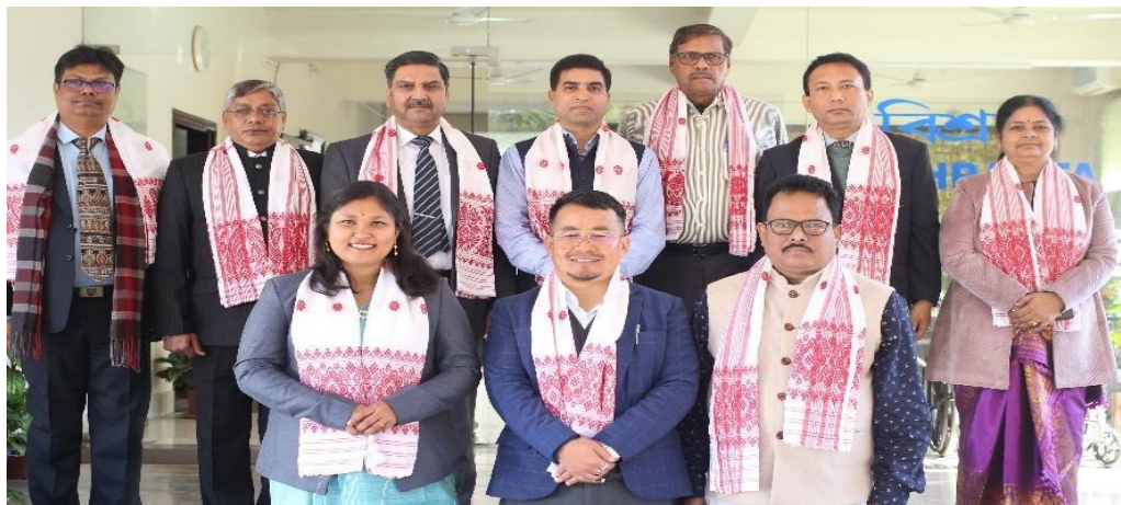
Hon'ble Members of the Court of Sri Sri Aniruddhadeva Sports University who attended the first meeting.