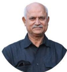
Shri Zafar Iqbal (Hockey) Padma Shri Awardee and Olympic Gold Medalist (1980) Member, Court