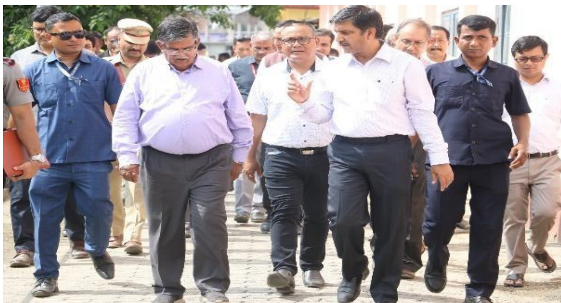
Hon'ble Chancellor Shri Gulab Chand Kataria, visits the Study Centre

In alignment with the Government's directive to implement the National Education Policy (NEP) 2020 from the academic year 2023, the university launched a pioneering four-year undergraduate programme titled " Bachelor of Physical Education (Honours) with/without Research ". This innovative programme was designed with multiple entry and exit options and offered majors in Exercise Physiology, Sports Psychology, and Sports Biomechanics, along with a minor specialization in one sport and exposure to five sports disciplines.